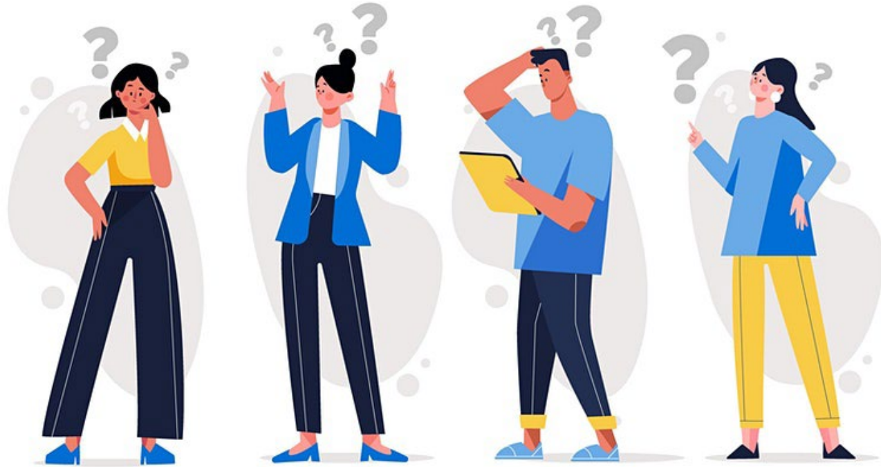
Illustration by Unknown Author is licensed under CC BY